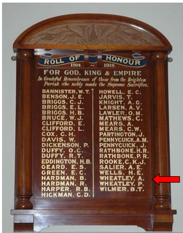
St. Mark's Roll of Honour