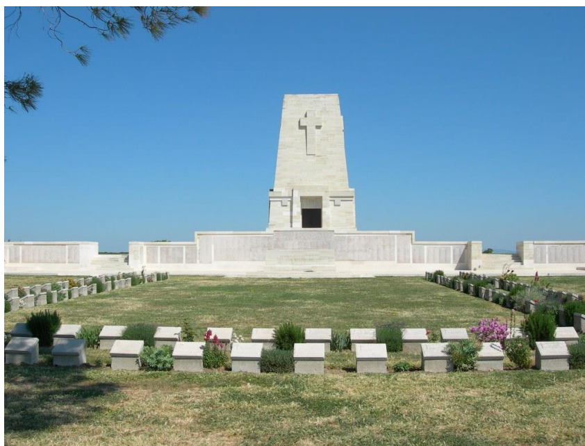
Lone Pine Cemetery & Memorial