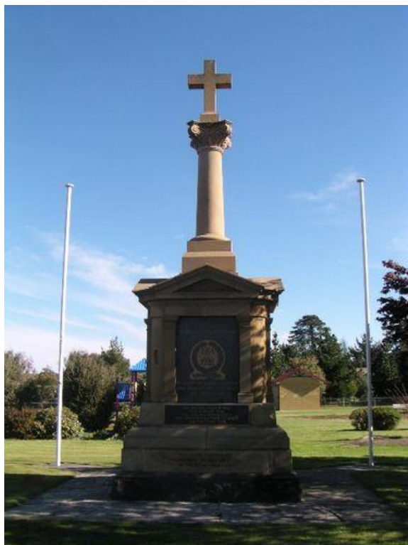
Municipality of Brighton War Memorial